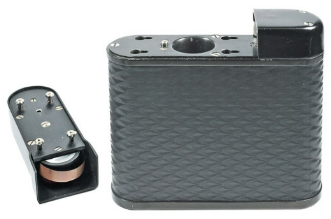
Tape cassette (left) and recorder. A 3V dry battery fitted into the hole in the centre.