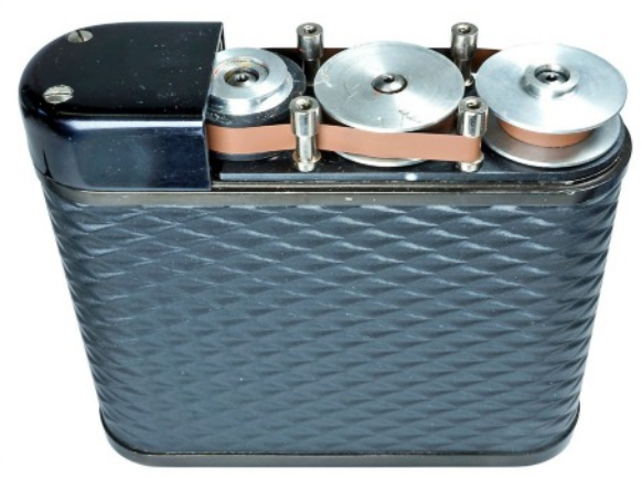
Top view of the recorder with cassette cover opened.

'Grille' was issued by the Bundesnachrichtendienst to agents operating in the GDR for locating and recording signals from pulse radar systems. It may be speculated that the sound produced by a Grille (German for Cricket), quite similar to that of detected pulse radar signals, led to this name. The set was comprised of a miniature battery operated transistorised tape recorder and two directional aerial assemblies, each with a microwave diode detector for receiving 3cm and 10cm radar signals. The ¼ inch standard magnetic tape was held in a small cassette which would be sent back for investigation after a successful operation. The recorded information on the tape was the PRF (pulse recurrence frequency) and speed of rotation of the radar aerial (hence the requirement of a constant speed drive motor). In addition to the recordings came the agent's personal observation of the frequency band (3cm or 10cm aerial assembly used during recording) and location of the radar site (if in view), or the approximate direction to the radar site at the point of observation.